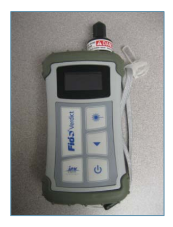
Verdict Enabler Software Open